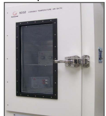
5032 Optional Window

The Guildline Model 5031/5032 Air Baths are an ideal choice for precision controlled operating environments for standards that cannot be used with an oil bath.