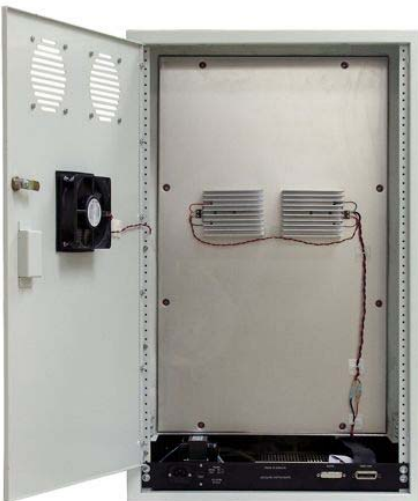
5030 Series Rear Access

Shown left is the swinging rear access door to provide easy maintenance access. 4 heavy duty side handles are also provided for moving the Bath. This Guildline Air Bath has been over-engineered to ensure that it operates properly and accurately, not only during the industry leading 2 year warranty period, but continuously for years to come.