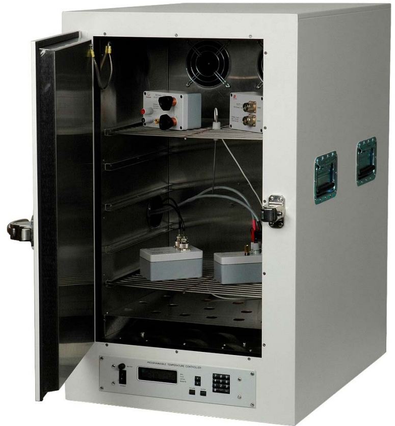
5032 Model Shown

Two circulation fans provide excellent circulation plus a measure of redundancy. In the unlikely event of a fan failure, the second fan will continue to allow operation with some reduction in control precision until repair is possible. These Air Baths have also been designed for ease of field maintenance using modular components and sub-assemblies.