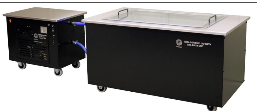
5600-300L Control/Mechanical Unit and Tank Unit

All Baths come with a removable EMI shielded gabled transparent tank cover allowing full access to the bath, and removable panels to allow easy access to the Bath interior. This entry access is shown to the left (closed) and shown to the right (door open).