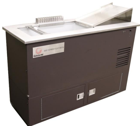
5600 Fluid Bath with 56004 Storage Cart